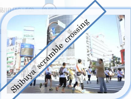
Shibuya scramble crossing