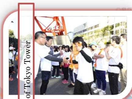
the base of Tokyo Tower

This year, approximately 700 runners, total of 20,000 people participated in the campaign. Not only child welfare workers but also high school students, fireman, policeman, and U.S. navy men ran to promote safer community for the children.