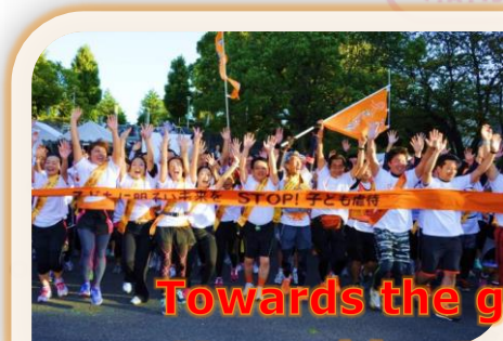
Towards the goal Yamashita Park